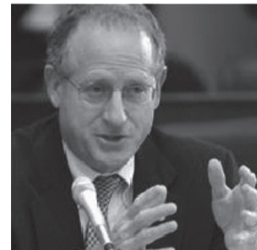
Congressman Mike Conaway

Conaway was treated to a gift basket of items from the Soap Shop and Machacek's Bakery and Market.