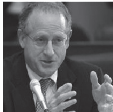
Congressman Mike Conaway