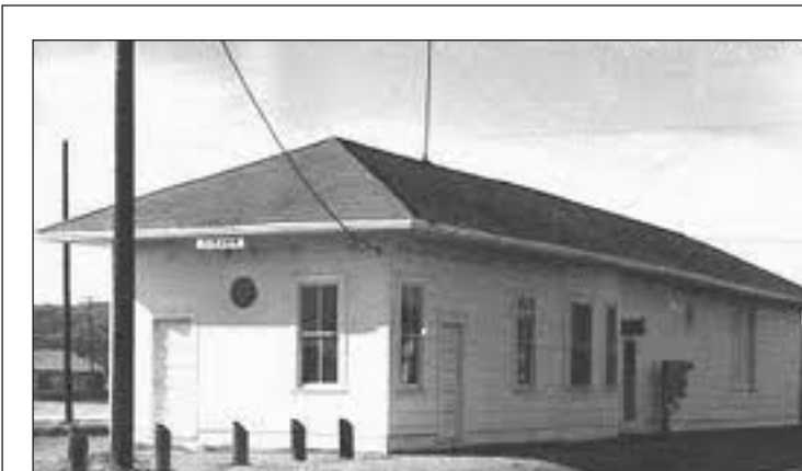
The old Strawn Depot, absent for years but once an important part of the community and a grand reminder of Strawn's history, could soon be returning to the area.

Funds are needed to move and set up the depot so it can become part of the Historical Museum complex. Possible plans include restoring the depot to its original condition to showcase how an historic train depot looked in the early 20th century. The depot could also be used as extra space to display more of