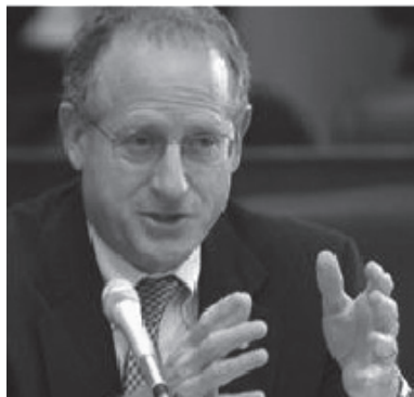
Congressman Mike Conaway