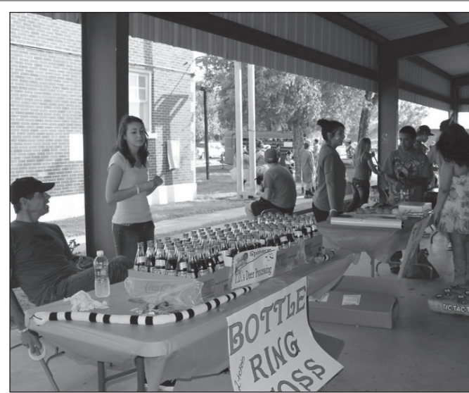
The Strawn Booster Club held its annual Fall Festival on Saturday, October 28th, and included a Haunted House, bounce house/slide and all sorts of games where prizes could be won.

The new section will include 4,100 feet of new pipe, 23-8" valves and 5 new fire hydrants. They will replace a section of the line on Palo Pinto Avenue. They will then replace a section of line running parallel to the North side of the railroad tracks, bore under the tracks and go south toward the school. They will also replace a section of line in front of the school. This project is funded by a Texas Department of Agriculture grant. The City of Strawn will provide $17,500.00 of the $275,000.00 project. Please be patient with the construction for the next few months.