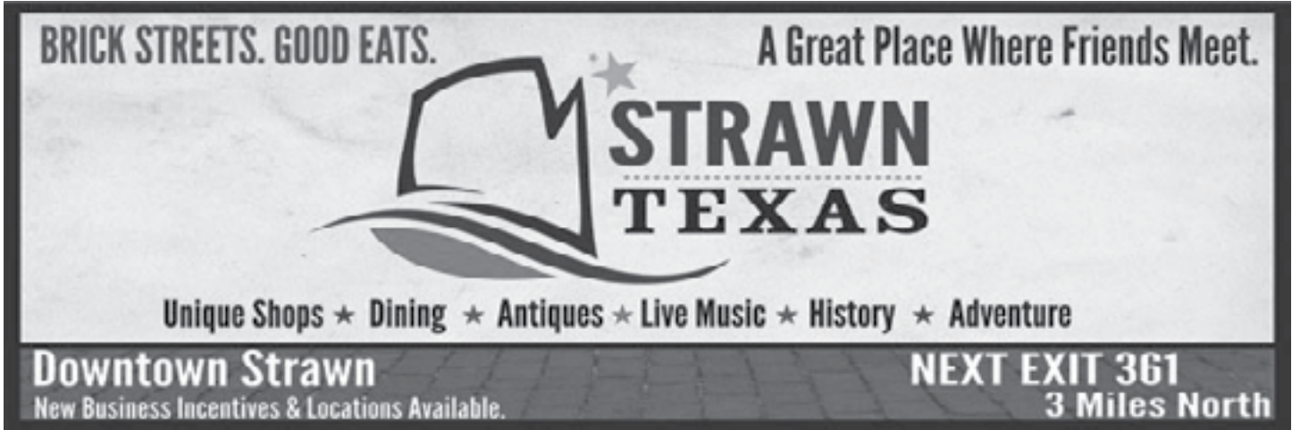
Interstate 20 will be home to a new billboard highlighting the city of Strawn. The billboard is the result of a collaboration between the Strawn Chamber of Commerce and the Strawn Development Corporation.