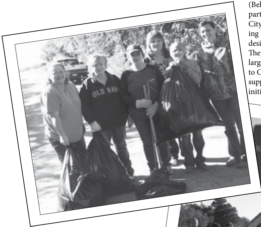
(Below) Members of C.A.R.E. participated in the November 1 City-Wide Clean-up by picking up litter along their 2- mile designated stretch of Hwy 108. The group picked up over 12 large bags of litter. Thank you to C.A.R.E. for continuing to support Keep Strawn Beautiful initiatives!