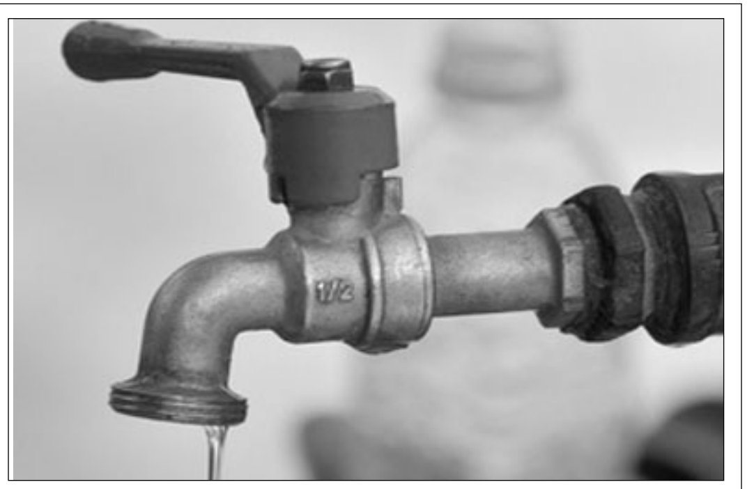
Due to the continuing drought, the City of Strawn has announced that Stage 2 of the 2014 Water Conservation and Drought Contingency Plan is now in effect.

Outside lawn/landscape watering is limited to one day a week be-(continued on page 2)